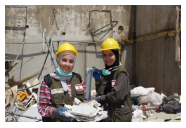
Youth Empowerment is always a priority

In the same context, the moral damages are greater than the material ones thusly, and based on the experience in psychosocial support; the experts at Utopia are launching soon the post-crisis mental health program to support people suffering from trauma and loss as a result of the explosion.